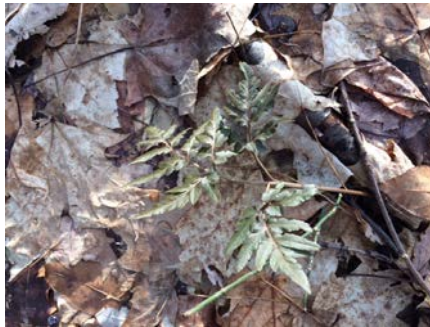
Grape fern, Botrychium sp