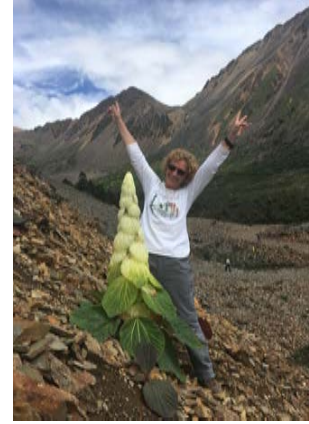
Rheum nobile shown in perspective

We clambered up sheets of large scree to examine the plants, landslides of flat rocks slowing our progress. We had been told that Rheum nobile requires sharp drainage, growing in the steepest conditions, but that was an understatement! We had also heard that the locals gather their stems for salads. The precarious climb made us appreciate their determination. And the closer we got, the more amazing and tall R. nobile became.