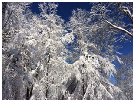
Snow, trees and sky