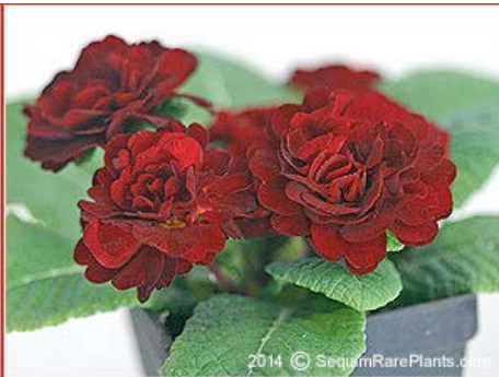
2014 © SequimRarePlants.com