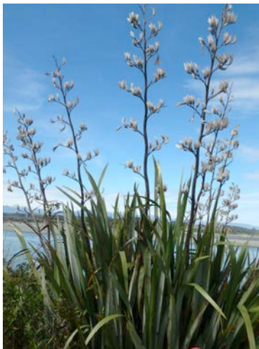
Flax, Phormium tenax

His expedition named many plants. These common names are used to this day and had me confused for some time since they ran contrary to my knowledge of what these plants should look like.