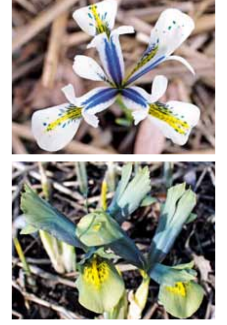
Iris 'Sea Green' (above) fades to blue and Iris 10-BL-1 (below) has unusual dark shades with yellow