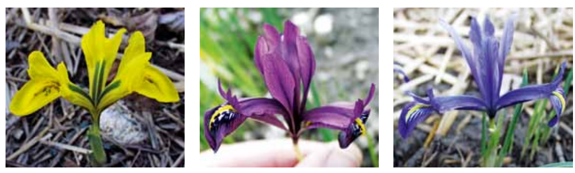
Parent species used in the breeding programme: Iris danfordiae collected from near Darboğaz in Turkey (left); an unidentified purple-flowered species collected from near Çat in Turkey (centre); and Iris sophenensis (right) obtained from a cultivated source

their place is numerous rice-grainsize bulbs. When bought from a bulb supplier they usually have sufficient energy to regenerate two bloom-size bulbs for the following year. But conditions in most gardens are not good enough to produce further bloom-size bulbs. More gardenworthy, yellow-flowered Reticulata irises are needed.