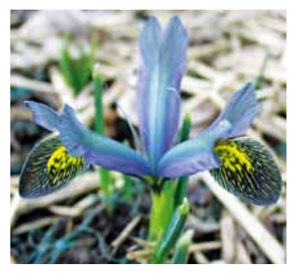
Iris 'Storm' will hopefully be made available commercially by UK nurseries

If you need to store the bulbs out of the soil then dig them up just as the leaves are dying down. Store them over summer in mesh bags hanging in a cool, dry location. If you dig up bulbs at the end of summer or early autumn, and leave them unplanted for a couple of weeks, they can go soft. If you do this, make sure you replant them within two days. Bulbs dug up in early summer and properly dried are fine in storage.