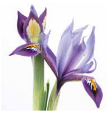
Iris 'Velvet Smile' received a Certificate of Preliminary Commendation from the RHS in 2016

If you plant seeds or bulblets, be sure to cover them each winter with a mulch of leaves, or better yet, straw to keep the soil surface frozen and prevent premature germination or growth. Once the snow has melted you can remove most of the straw.