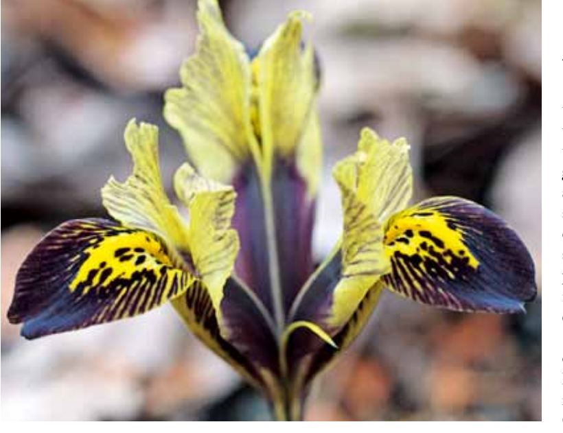
Seedling 05-GQ-3 dates from 2012 and is one of the best yellow and reddish purple selections

By the time the leaves die down in late June they have grown to 45– 60cm in length. A bulb forms at the base of each leaf, so if you damage the leaves you are directly damaging next year's bloom.