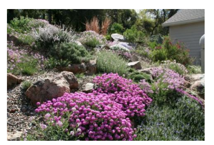
Aethionema grandiflorum 'Warley Rose'

I am coordinating our Chapter's version of the 20 best (and hardy) rock garden plants. Everyone in the chapter has the opportunity to contribute your favorites. I will need the plant name (botanical and variety, if a named variety and common name if known), and its habitat and soil condition. For example, Aethionema grandiflorum 'Warley Rose,' full sun in rock garden soil. You can submit 1 plant or 20 or anything in between and I will pare down the final list to 20 plants. Submit your plant list by Oct. 1<sup>st</sup> to me, John Gilrein,