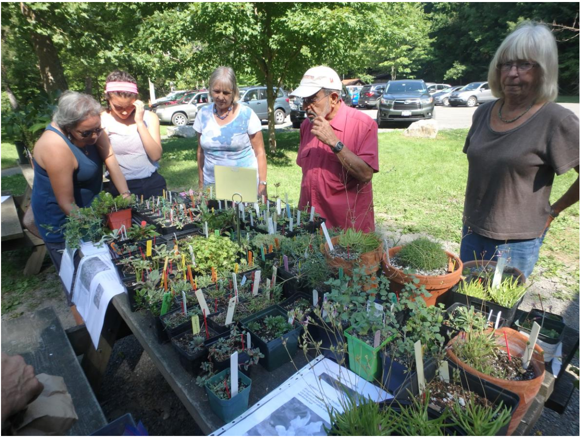
Perusing the rock garden plant selection at our August sale

growing them with some success. Surprisingly, even with this summer's drought there was a nice selection of perennials in August. Many plants have been struggling for lack of rain, exacerbated by high temperatures as well. If you attended one or both of these sales, then you certainly had the opportunity to purchase some quality plants at bargain prices. If you missed these sales, be sure to plan your schedule next year to attend.