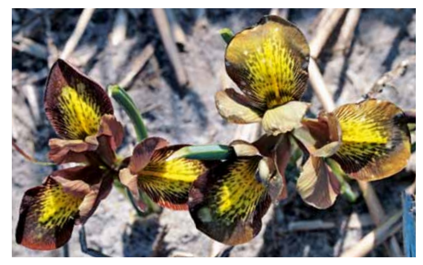
Iris 'Mars Landing' is an unusual combination of reddish brown and yellow.

To develop wider ranges of colours and patterns I need to pull out recessive genetic characteristics. Unfortunately, this is harder when working with polyploids, so there is an incentive to continue breeding at the diploid level and have a laboratory convert the most interesting to polyploid for breeding or commercial purposes. This is an expensive proposition, and I do not