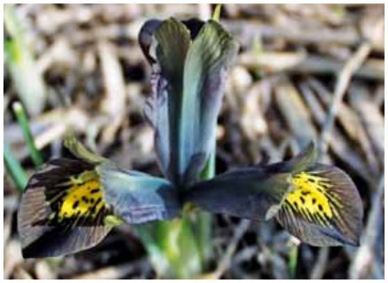
Examples of more unusual colours with shades of green and brown include Iris 'Sea Green' (left) and Iris 'Down to Earth' (above).

occasionally produced spotted, pale blue-green hybrids.