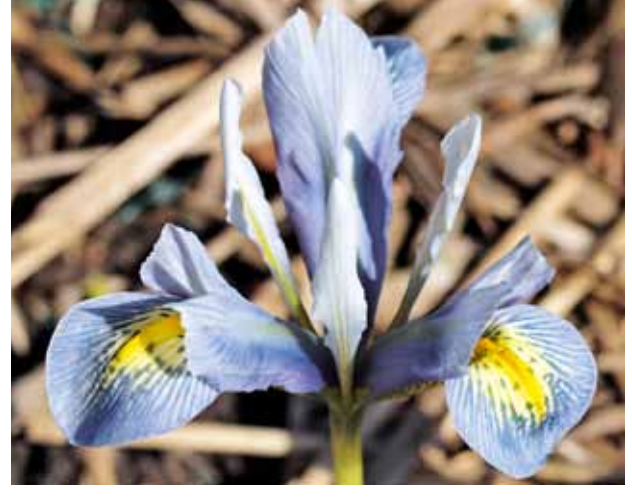
Seedling 06-CC-3 (above) is pale blue and Iris 'Plum Cuddles' (right) is a good purple. Extra flower parts sometimes appear in Iris 'Eye Catcher' (below).