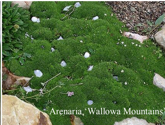
Arenaria, 'Wallowa Mountains'